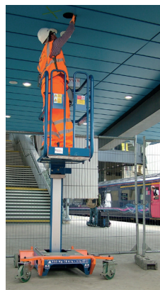
Pecolift Wind Rated is operable on gradients up to 3° and in winds up to 12.5m/s

Available as an option to the standard machine, Pecolift Wind Rated is operable on gradients up to 3° and in winds up to 12.5m/s.